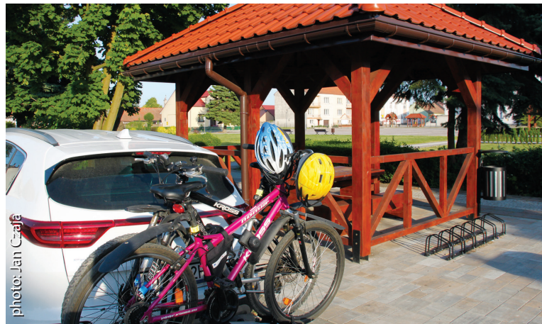
On the EnoVelo trail in Uście Solne