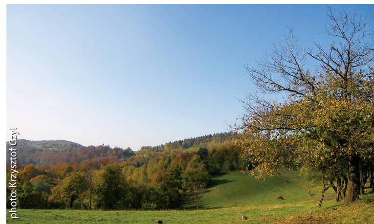
Ciężkowicko-Rożnowski Landscape Park