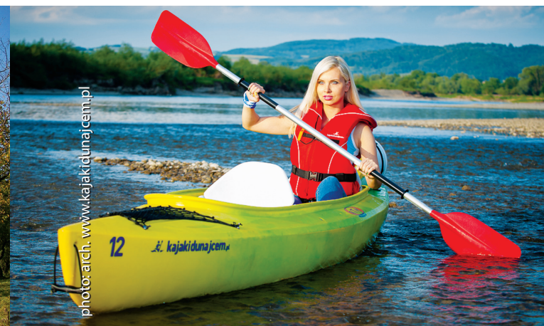
Kayaking on the Dunajec River