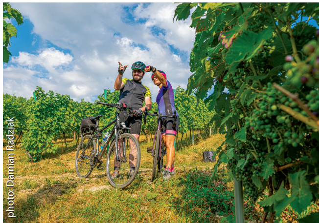
By bicycle to the vineyard