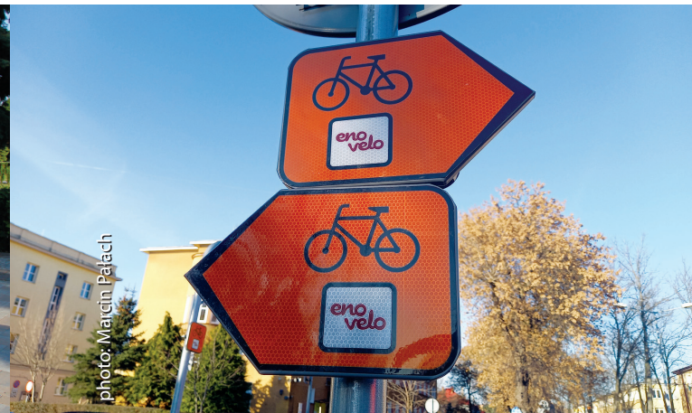
On the EnoVelo trail