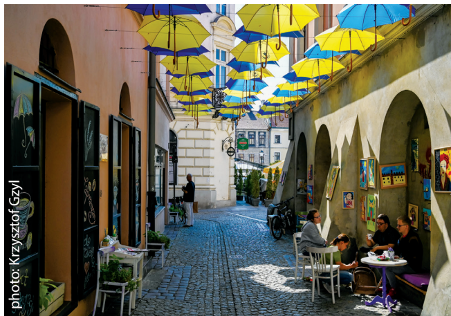
Piekarska Street in Tarnów