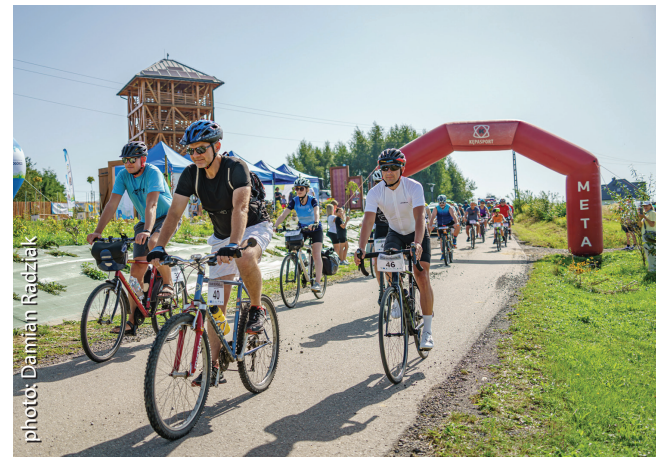
Tour de Pogórze