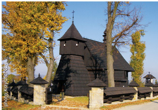
St. John the Baptist Church in Rzepiennik Biskupi