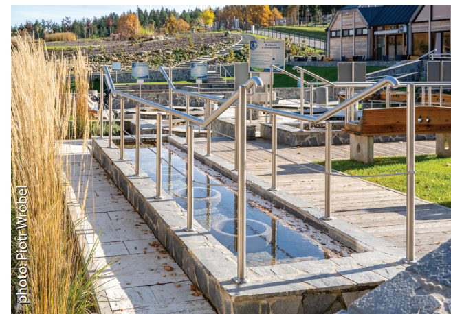
Spa Park in Ciężkowice