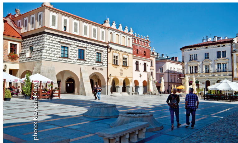
Renaissance townhouses on the market square in Tarnów