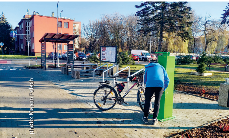
Cycling service point in Tarnów-Mościce