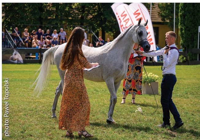
All Polish Arabian Horse Championship in Tarnów – Klikowa