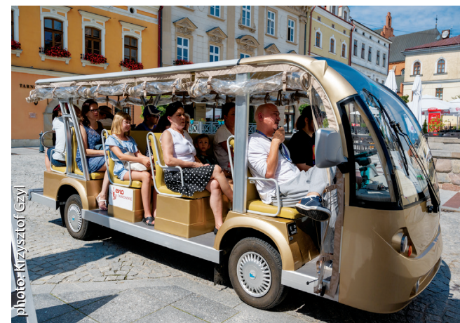
Sightseeing Tarnów by Enobus