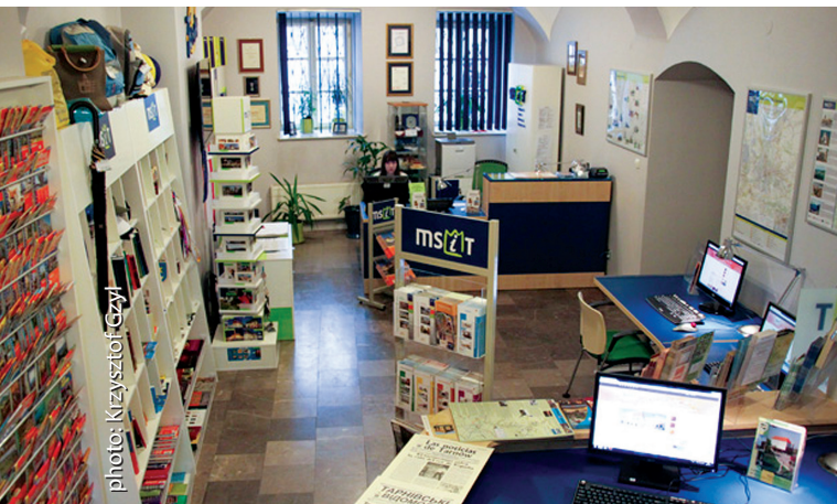
Tourist Information Center in Tarnów