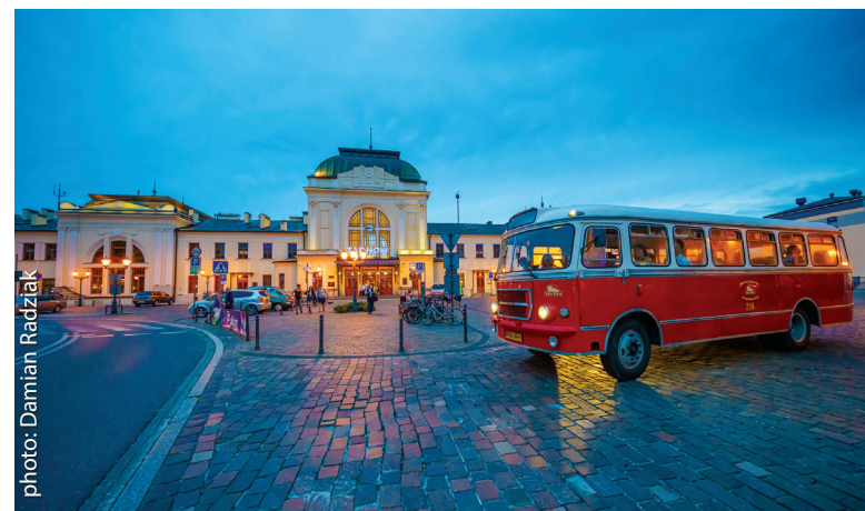
Historic bus in front of Tarnów railway station