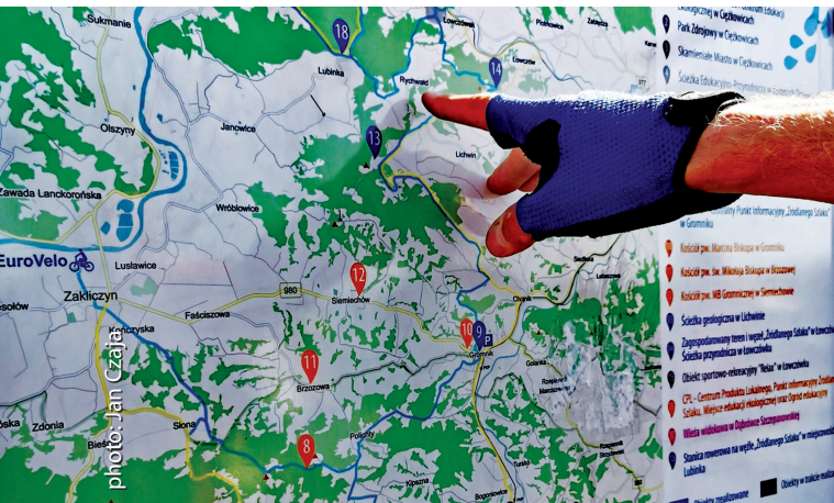
On the Spring Trail