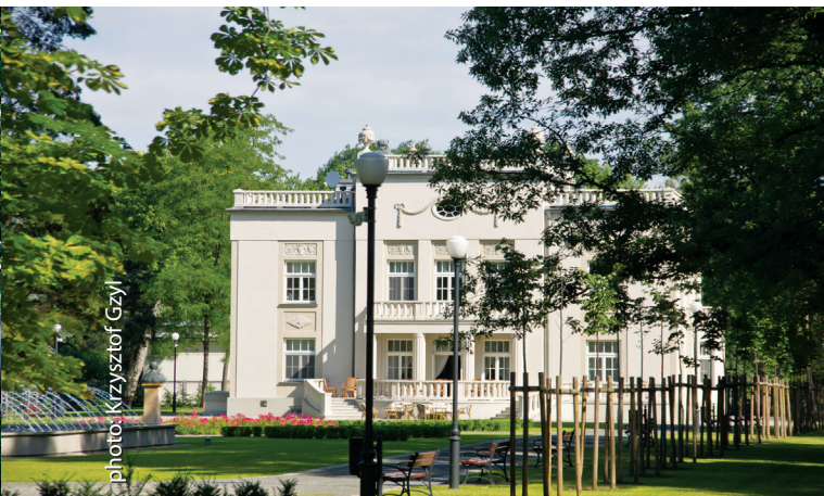
Villa of Eugeniusz Kwiatkowski in Tarnów