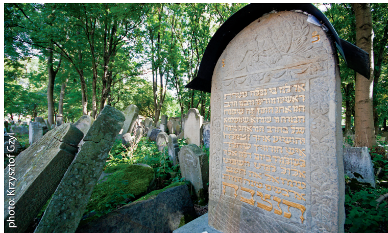
Jewish cemetery in Tarnów