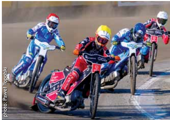
Speedway racing in Tarnów