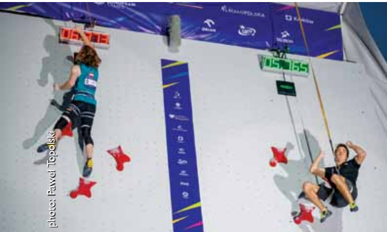
Speed climbing (European Games 2023)