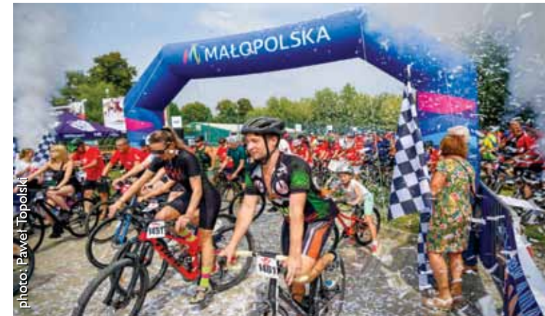
Family bicycle rally "Małopolska Tour"