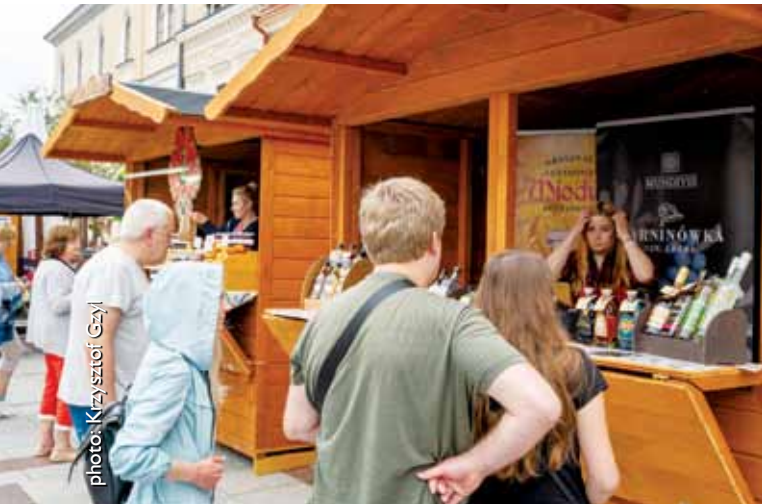
Galician Fair in Tarnów